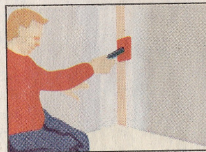
TONY LONE FIGHT - ILLUSTRATIONS SPECIAL TO THE OBSERVER

Repeat if needed; make sure tape is covered completely. After both sides dry completely, sand with a drywall screen on a sanding pad.